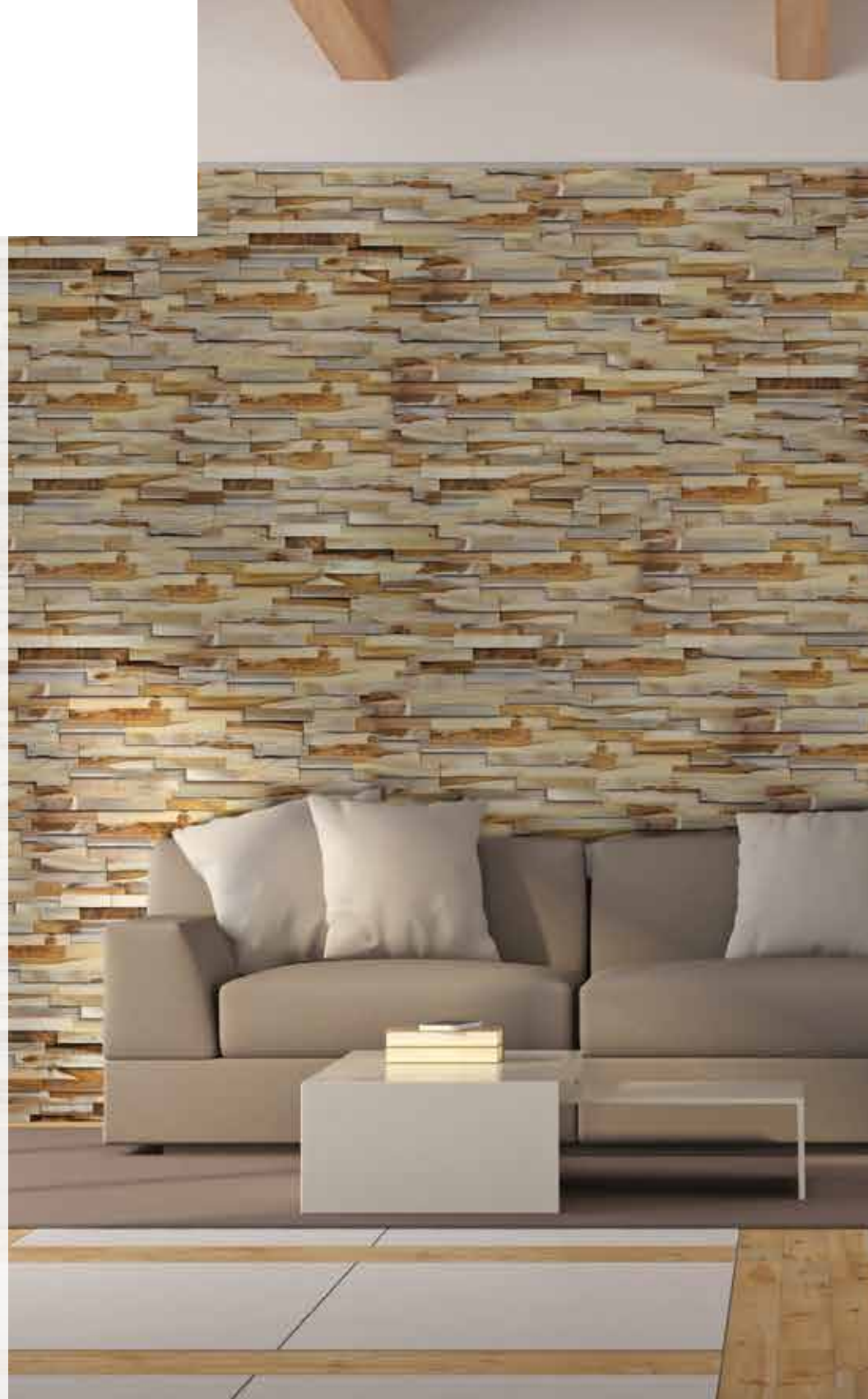
PICTURED ABOVE (Waiting Room): Noblewood's Classic Teak, Natural (5006), is a beautiful addition to any residential or commercial space.

Noblewood's Classic Teak is available in Natural (Order No. 5006). So, you can enjoy it as it is or stain it any color to match your color palette.